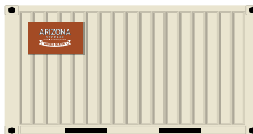
20' GROUND LEVEL STORAGE CONTAINER