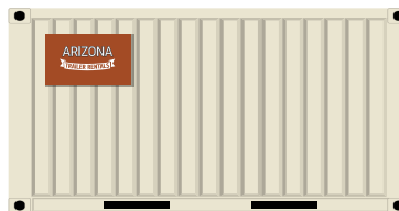
20' GROUND LEVEL STORAGE CONTAINER